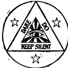
Emblem of Christ and Symbols of the Philosophy of the Order of the Seal

The symbol of an Order is its standard or flag. It symbolizes both its source, its object and its policy and sets the standard by which it must be judged. Hence it is important that persons belonging to or coming in touch with any Order or Movement should understand something of the emblem by which it is known on the higher planes.